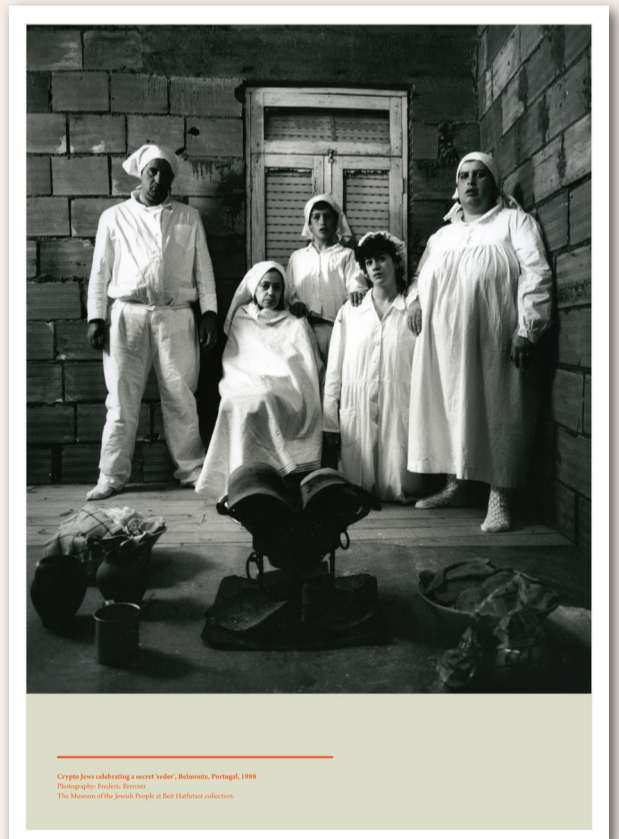
Crypto Jews celebrating a secret seder, Belmonte, Portugal, 1988